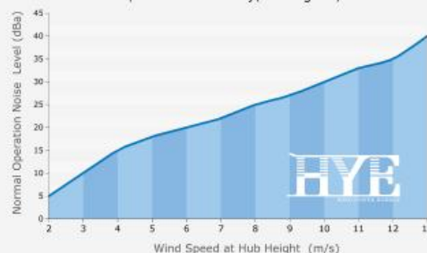
Wind Turbine Noise Level on HY-1500 (Standard Air Density(1.225 kg/m 3 ))

Everything with moving parts will make some noise and vibration, and wind turbines are no exception, most noise and vibration are caused by turbine blades rotation in the wind and generator resonates with rotor and tower, HY Energy well designed wind turbine could works quietly in both low and high wind.