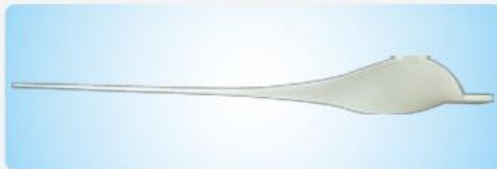
Blade side view

Patented aerofoil 5 blade design with true symmetrical and twisted aerodynamic design which ensures rotor capture maximum power from wind ( C_p > 0.35 in low wind) and operates in amazingly low noise and minimal vibration.