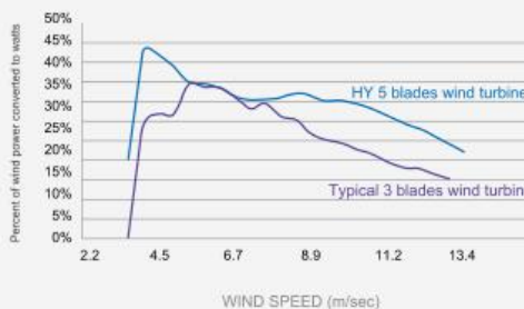
5 BLADES & 3 BLADES WIND TURBINE EFFICIENCY COMPARISON

HY 5 blades wind turbine shows excellent wind power utilizing efficiency at lower wind (more than 40%), and also good performance at higher wind because smart blade aerodynamic braking could limit rotor speed within its rated RPM to keep generating power in higher wind.